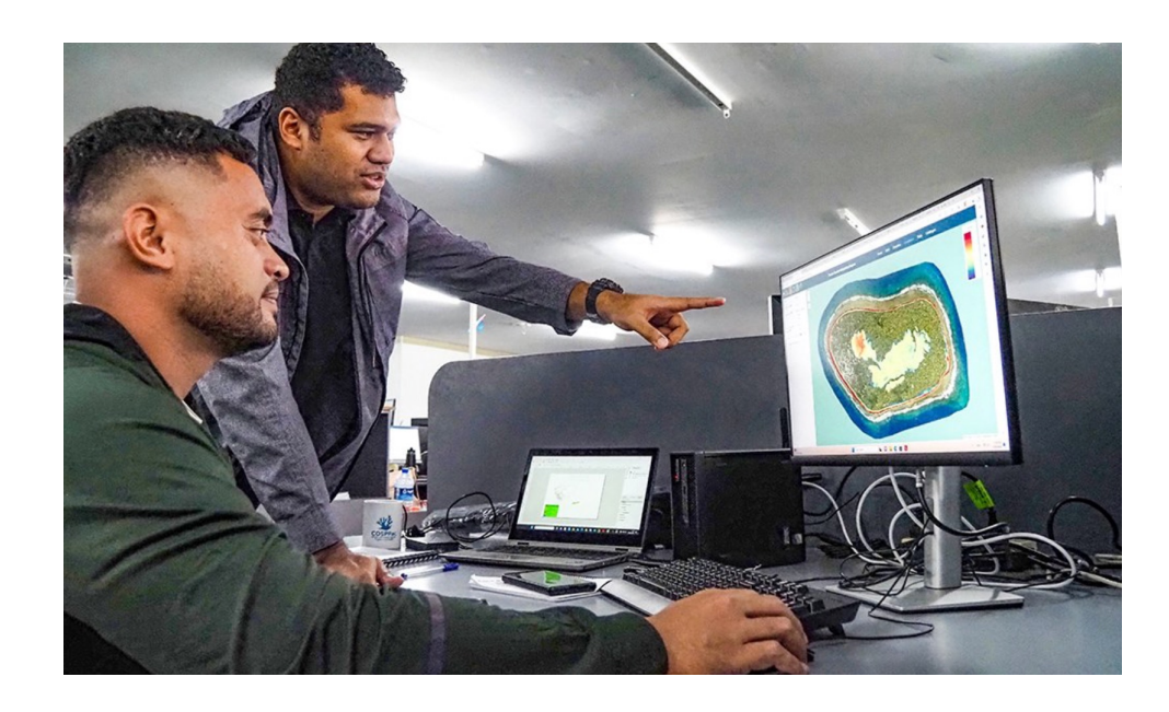
GCF: $ 36 million; Gov co-finance: $2.9 million

3. Financing: annual budgeting; monitoring at community levels