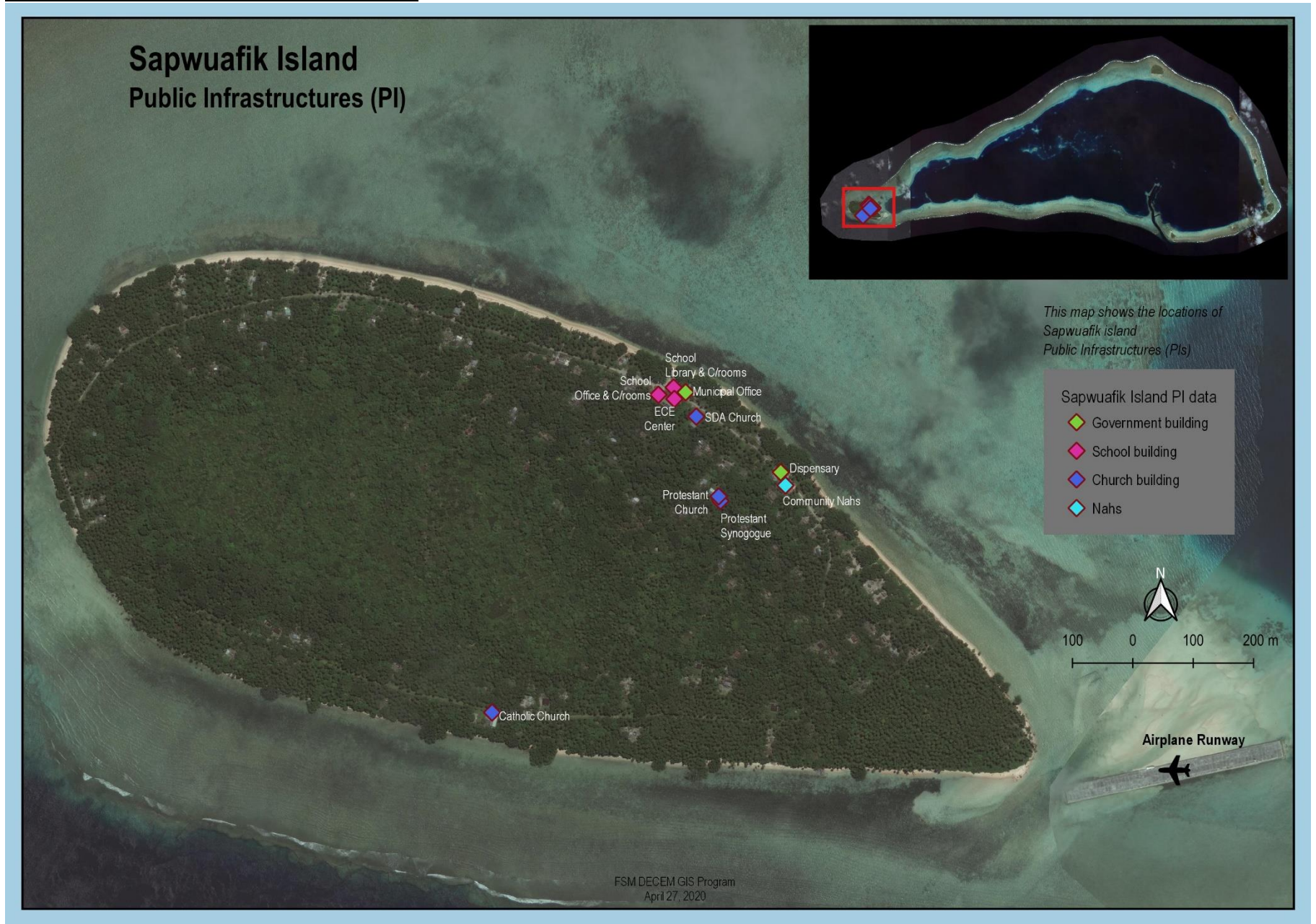
Map 1: Sapwuafik Island Public Infrastructures Map