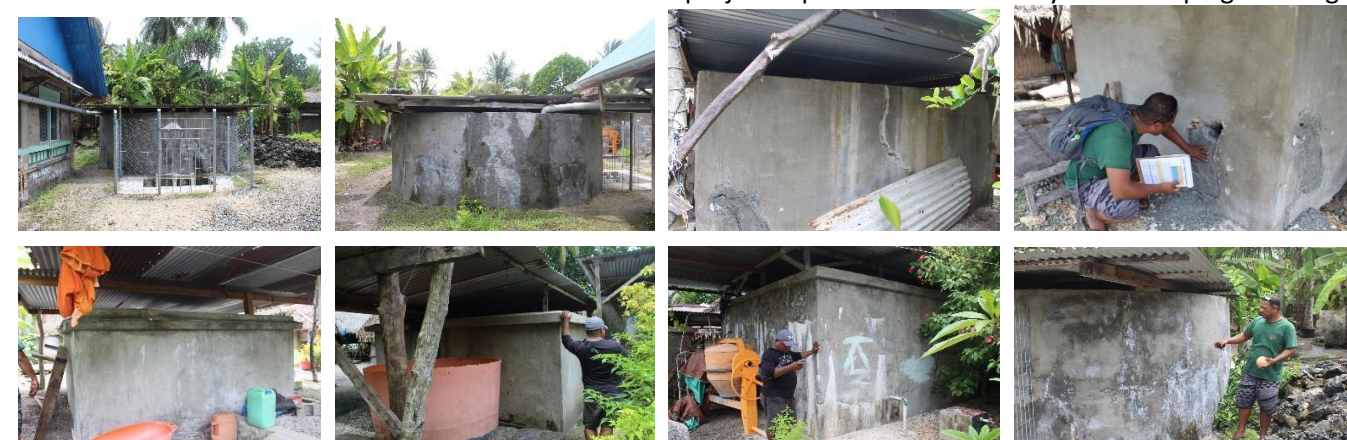
Below are the SPC-FSM RENI project water tanks/sites on Kapingamarangi that the team also noted and tested the tanks water quality.

Shown below are some of the water tanks that the AF project repaired for community use on Kapingamarangi: