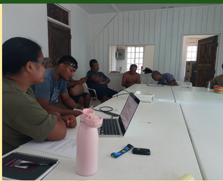
Gagil Consultation Meeting

The State Land Management Working Group (SLMWG), comprised of representatives from the Department of Resources and Development, Yap State Environment Protection Agency, Yap Farmers Association, Tamil Resources Conservation Trust, and the GEF7 Project, conducted a series of consultation meetings with the Council of Chiefs from the municipalities of Gagil and Tamil to validate the GEF7 Project's demonstration site for Yap State.