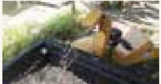
Portably Dry Litter Piggery (DLP) in Kosrae

Among all, I would say the dry litter piggery (DLP) efforts of the project has created the most impact in Kosrae. The project selected four farmers to pilot DLPs in each of the municipalities in Kosrae and funded trainings for farmers on the operation of DLPs, including the use of compost as fertilizers. The basis of having a state-wide demonstration of the dry litter piggery method was significant to ensuring wider education and awareness on the benefits of DLPs, as well as leverage support for sustainable farming practices such as the use of compost fertilizers. This effort has gained so much interest among the general public that the FSM Congress recently appropriated 20K to support further expansion of DLPs in Kosrae.